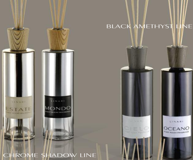
CHROME SHADOW LINE